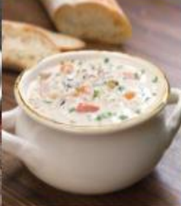
Creamy Wild Rice and Chicken