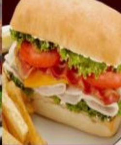
Church Club Sandwich