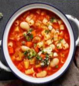
Pasta Fagioli Soup