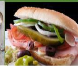
Ham Italian Sandwich