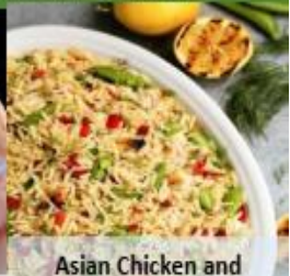
Asian Chicken and Orzo Salad